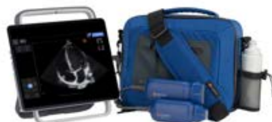
Add Kosmos Link to Kosmos Mobile configuration

Kosmos Link enables hours of continuous scanning with charge-while-scanning capability, multi-probe connectivity, and enhanced power delivery for advanced Doppler imaging.