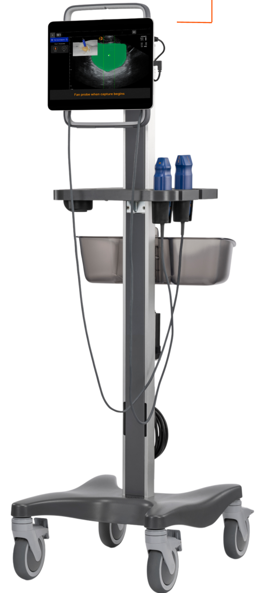
Fully detachable for ultimate flexibility

Kosmos Bladder represents a groundbreaking ultrasound solution that sets a new standard for bladder volume measurement.