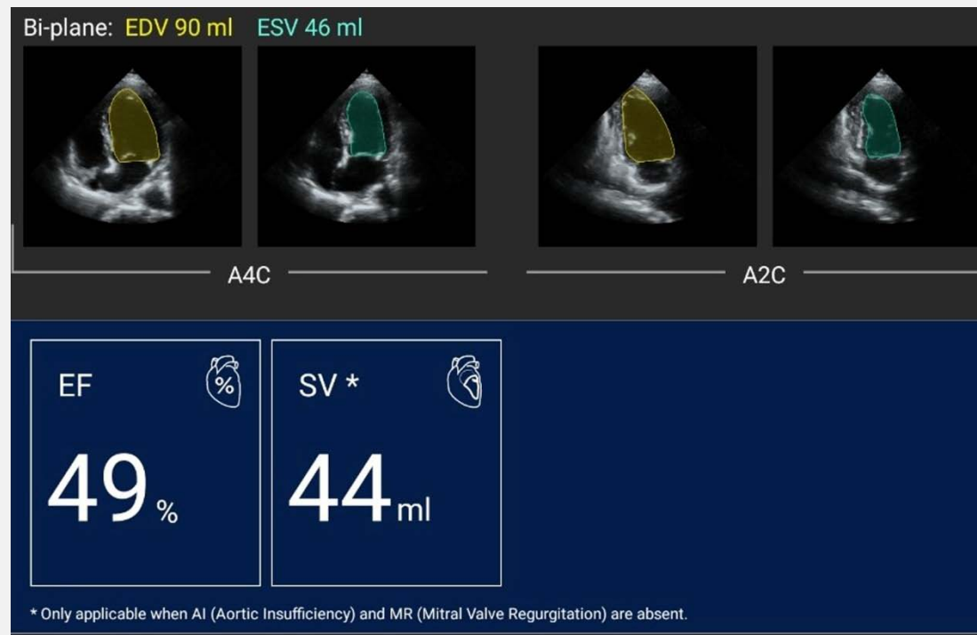
Figure 1: Automatic quantification of LVEF by Kosmos autoEF AI-assisted algorithm

We prospectively included consecutive patients who were referred to a tertiary hospital echocardiography laboratory for a standard echocardiography examination. The modified biplane Simpson's method was used to determine LV volumes and function from the apical four-chamber and apical two-chamber views. All patients were subsequently scanned by the same observer with the Kosmos HUD (Echonus, Inc) and a fully automated estimation of the LVEF was possible after acquisition of the same two apical views within seconds by the device itself with the use of the AI-assisted autoEF algorithm (Figure 1). The image quality for each examination was assessed and classified as good, moderate and poor.